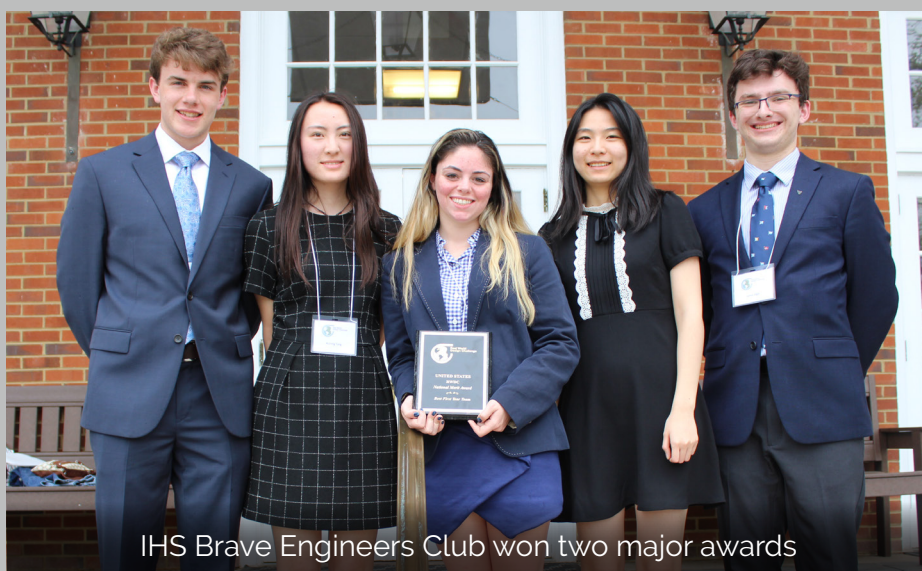
IHS Brave Engineers Club won two major awards