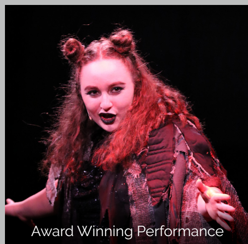
Award Winning Performance