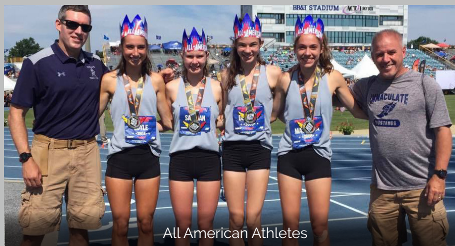
All American Athletes