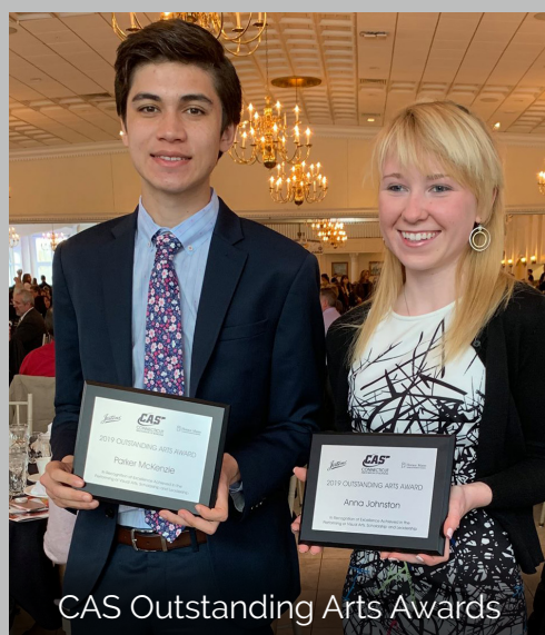
CAS Outstanding Arts Awards